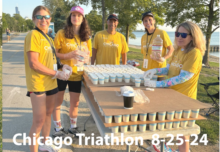
Chicago Triathlon 8-25-24