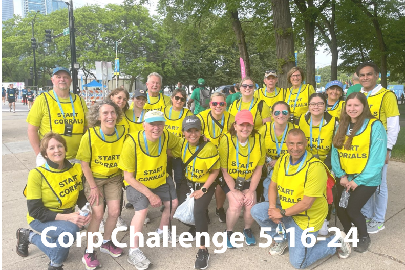
Corp Challenge 5-16-24

Volunteering at races is a fun and rewarding way to help raise funds for Jim's Bridge! The race organizers make a donation to Jim's Bridge based on the number of volunteers we recruit for the event. Here are some of the races where Jim's Bridge volunteered in 2024