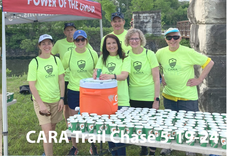
CARA Trail Chase 5-19-24