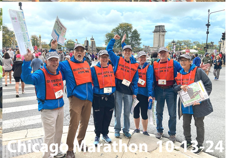
Chicago Marathon 10-13-24