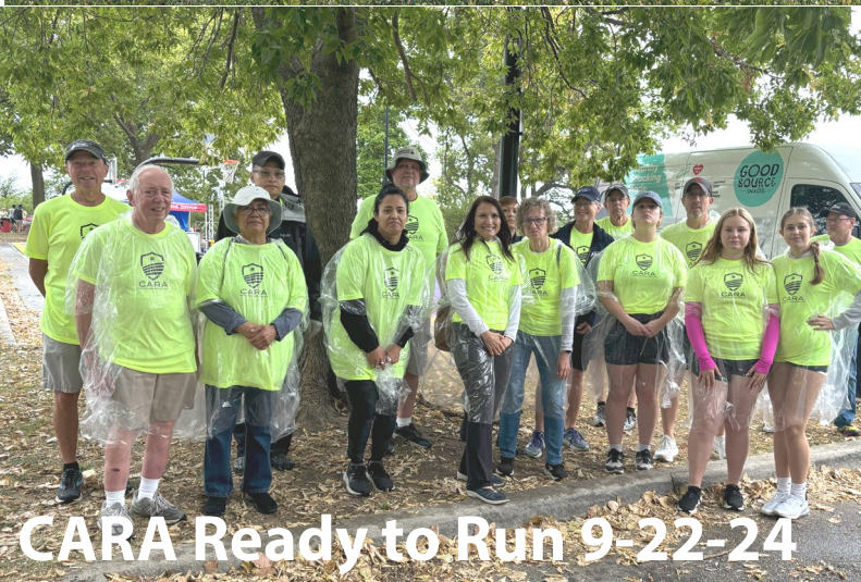
CARA Ready to Run 9-22-24