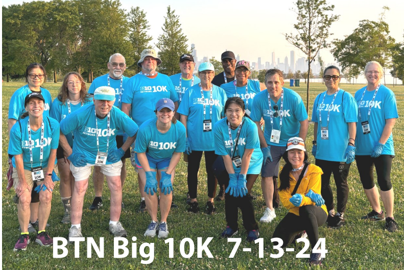
BTN Big 10K 7-13-24