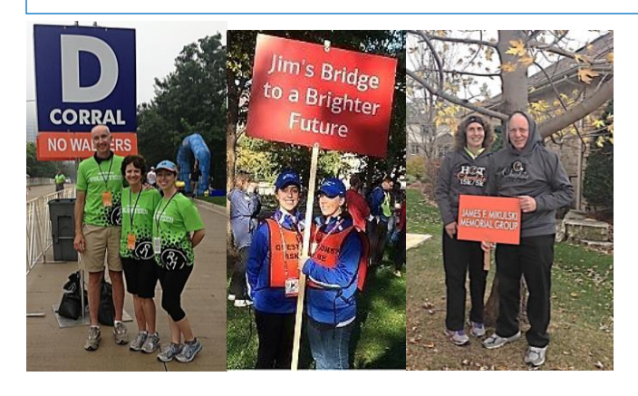
JPMorgan Chase Corporate Challenge